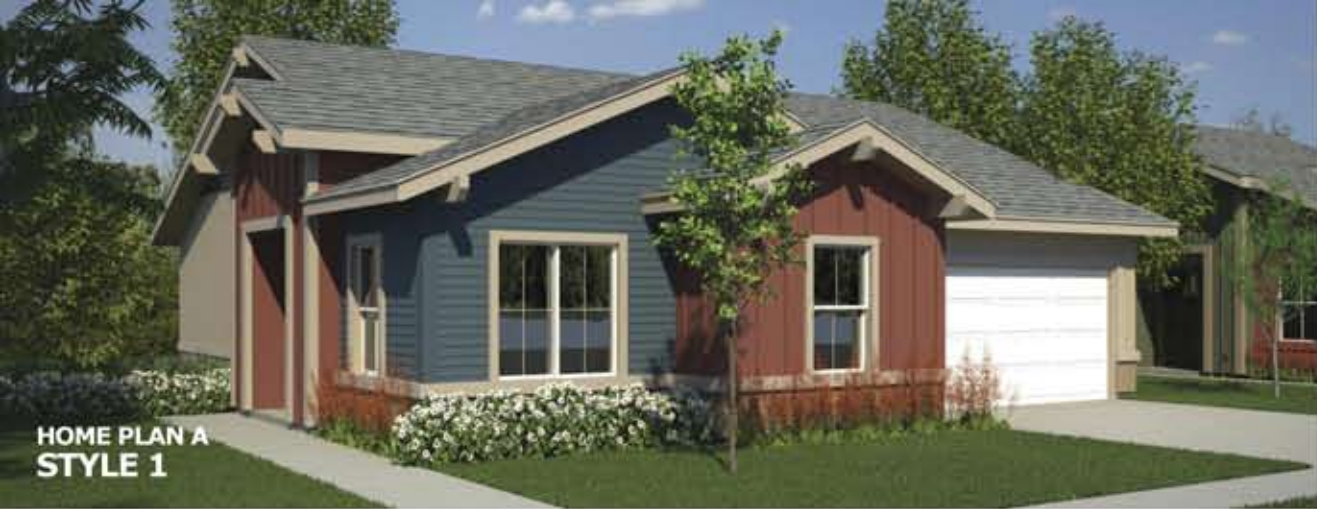
HOME PLAN A STYLE 1