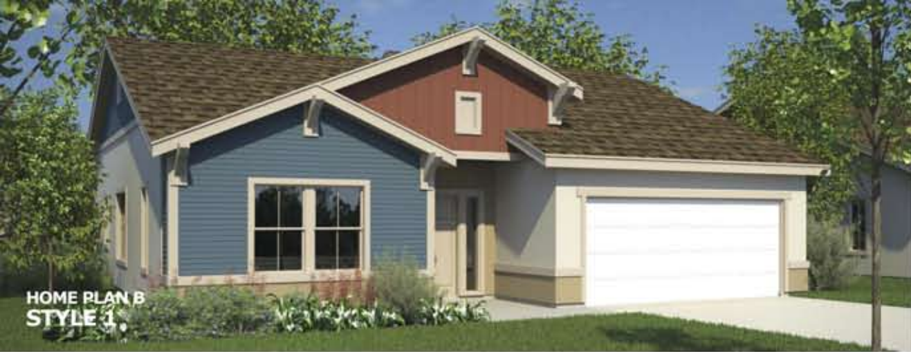
HOME PLAN B STYLE 1