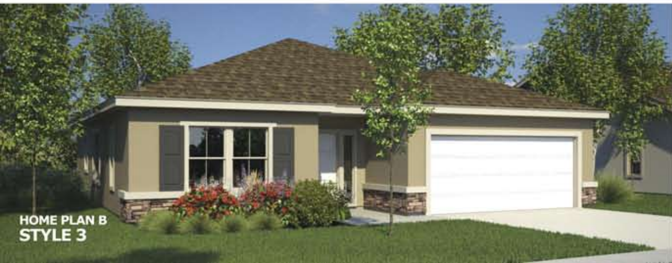
HOME PLAN B STYLE 3