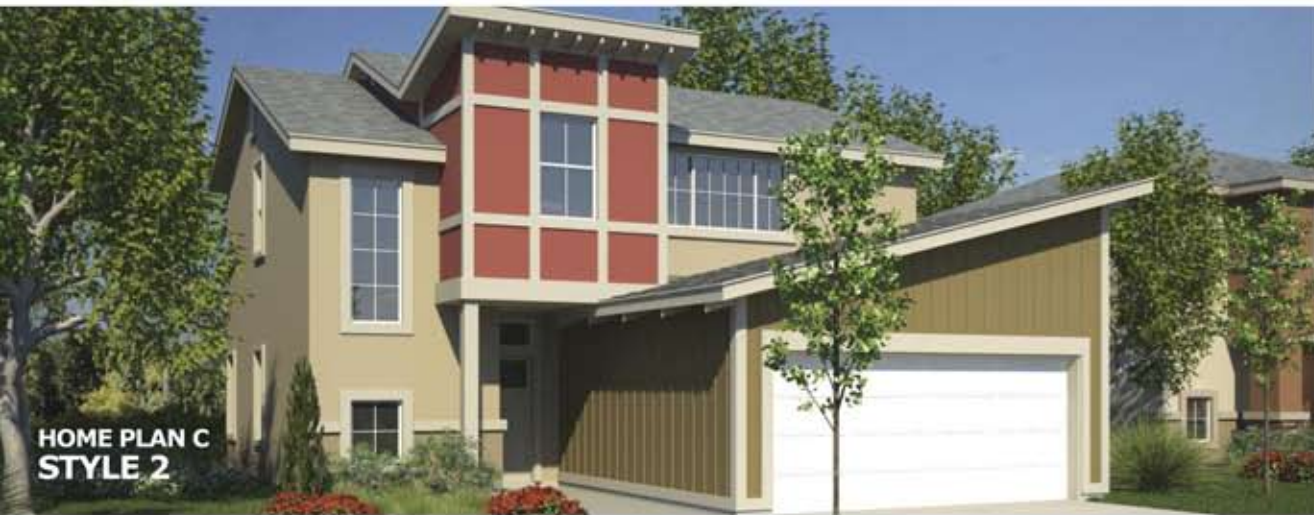
HOME PLAN C STYLE 2