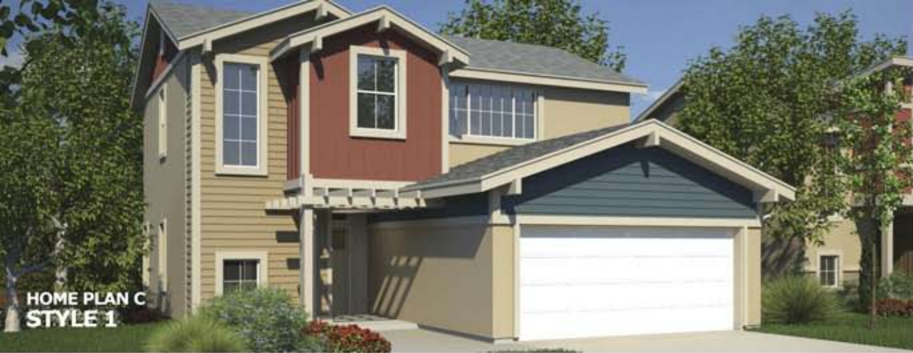
HOME PLAN C STYLE 1