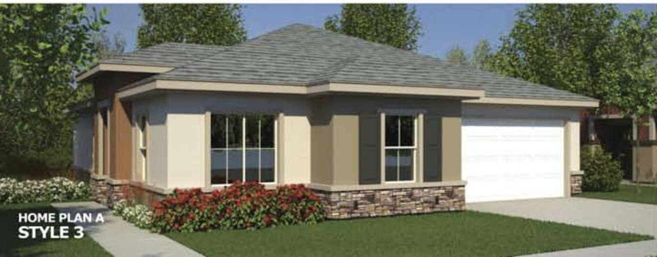
HOME PLAN A STYLE 3