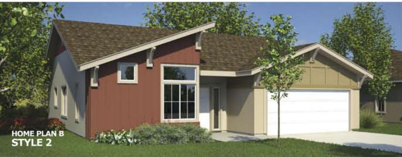
HOME PLAN B STYLE 2