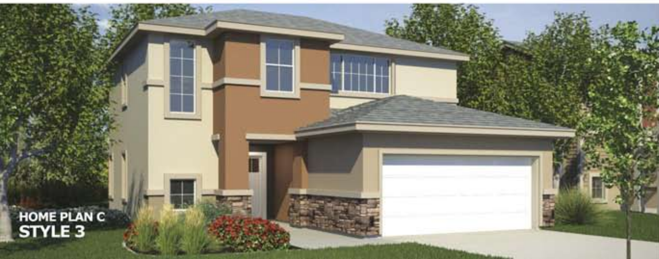
HOME PLAN C STYLE 3