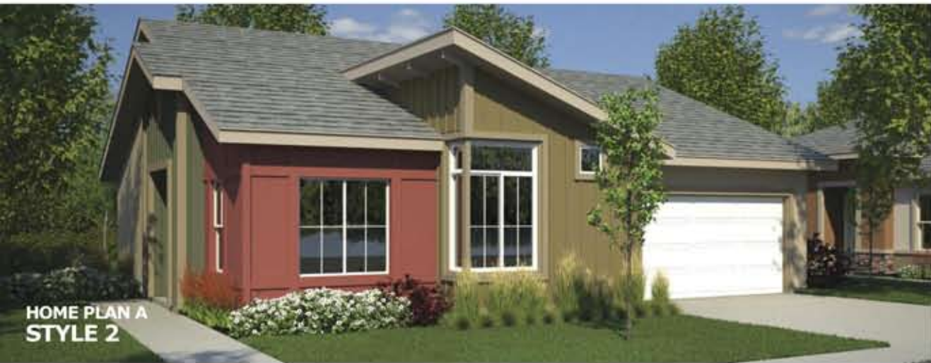
HOME PLAN A STYLE 2