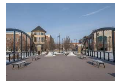
901 Pier View Drive and 900 Pier View Drive are the premium office buildings at Snake River Landing. The large mixed-use development includes offices, single-familiy homes, an apartment complex, and a pier that juts into the river.

Idaho's largest, most diverse mixed-use development may well be across the river from historic downtown Idaho Falls.